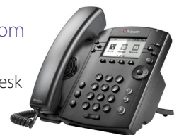
BT Polycom VVX411